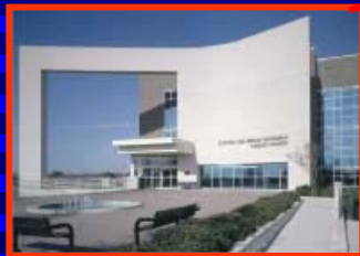
Univ. Texas Health Science Center, San Antonio