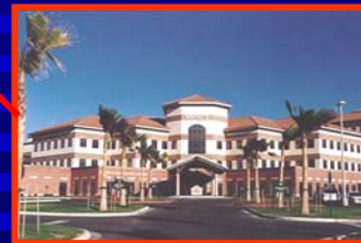
Mercy Hospital, Laredo