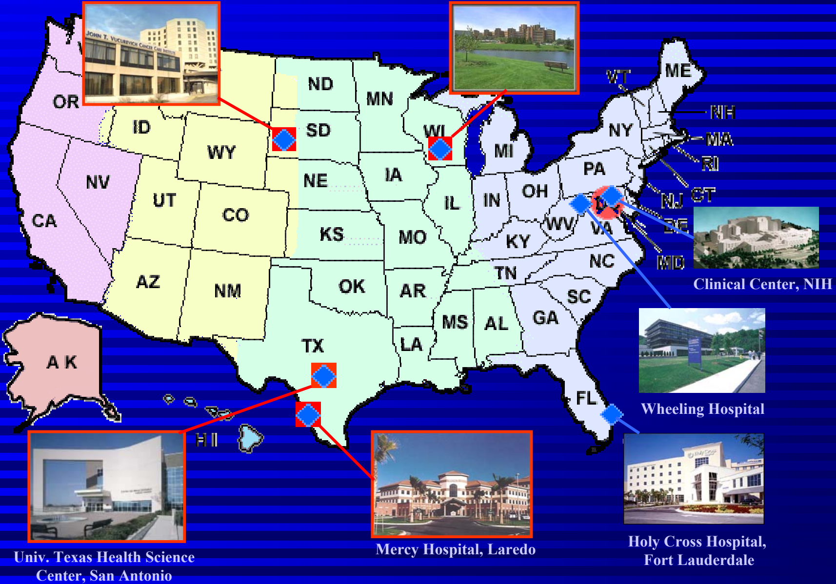
Clinical Center, NIH