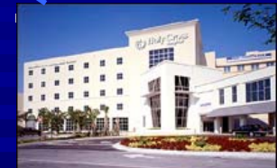
Holy Cross Hospital, Fort Lauderdale