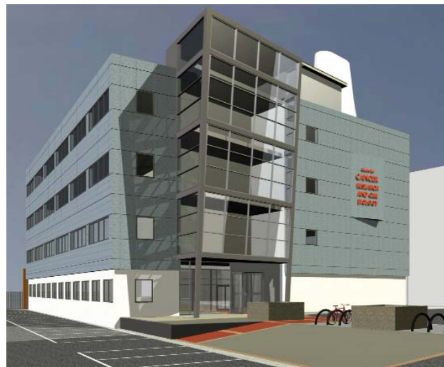
Artist's Conceptual Drawing of CCRCB (Centre to Open in March 2007)

A recent milestone of the Consortium's joint efforts to enhance Island infrastructure for cancer research and care is the Centre for Cancer Research & Cell Biology (CCRCB) at Queen's University Belfast (QUB), a cross-Faculty and interdisciplinary center that employs 41 high quality investigators and over 300 clinical/basic researchers. CCRCB's mission is to develop new avenues for the prevention, diagnosis, and treatment of cancer and to relieve the human suffering of cancer by developing the highest quality cancer research programs. The Centre facilitates the training of young scientists and clinicians to the highest standard and provides an environment where clinicians can interact with scientists at the forefront of their fields.