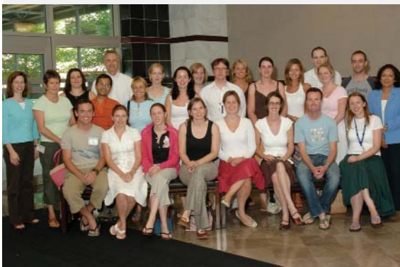
Island of Ireland Participants in the Molecular Course

A total of thirty-two health and cancer care professionals from the island of Ireland participated in two NCI Summer Curriculum in Cancer Prevention courses in July and August. The four-week Principles and Practice of Cancer Prevention and Control course was held 5-28 July, followed by the one-week Molecular Prevention Course from 31 July - 5 August. Since 2002, the Consortium has facilitated the participation of ninety-five island scholars. Course and application details are listed on the Consortium Web site at www.allirelandnci.org/new/sccp.asp .