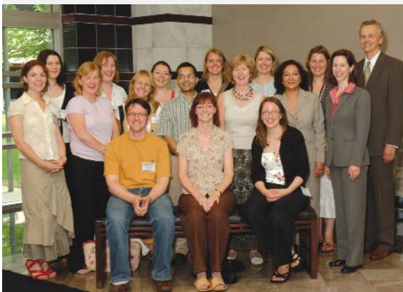
Island of Ireland Participants in the Principles and Practice of Cancer Prevention and Control Course