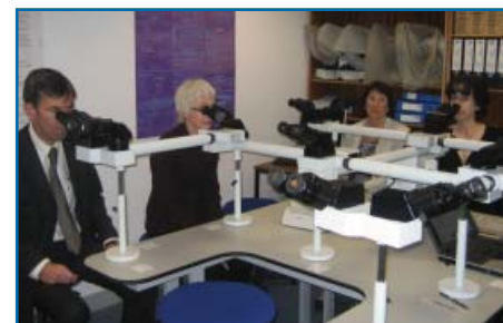
Expert Group participants examine data.

On 10-11 December 2007, the NCI delegation traveled to Dublin, Ireland to meet with the Expert Group. The delegates attended a workshop held at the HRB offices, as well as a mini-symposium at St. James's Hospital. These events united national and international experts to present and discuss relevant biobanking topics and develop recommendations for a range of logistic, operational, and scientific issues associated with implementing the National Cancer Biobank. Recommendations from previous Expert Group meetings informed all workshop and mini-symposium discussions. During the mini-symposium, the Expert Group had the opportunity to tour the facilities at Beaumont Hospital and the Prostate Cancer Biobank storage facility and laboratories at St. James's Hospital. Later, participants examined and discussed biobanking from an Irish perspective, the Biobanking and Biomolecular Resources Research Infrastructure, and the Prostate Cancer