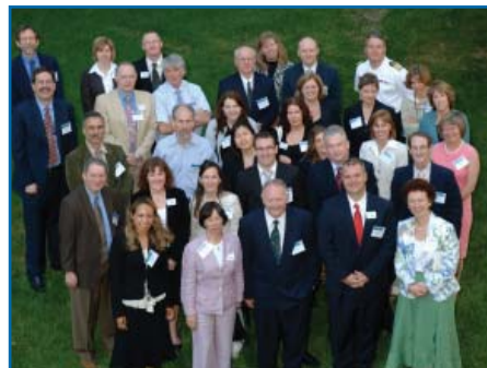
Attendees at the May 2007 All-Ireland Health Economics Workshop.

Economics Workshop in 2007 to foster the sharing of health economics and policy research information between Consortium participants and NCI staff and grantees. The meeting promoted productive dialogue among more than twenty delegates from Ireland and Northern Ireland and staff and grantees of the NCI on the similarities and differences between the national settings with regard to policy questions, organization of healthcare services, and data sources.